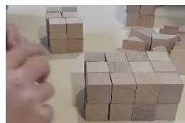
Figure 2: Marks two responses when making rectangular prisms with cubes.

For Question 5 when asked to construct a different rectangular prism using these cubes he constructed a 3 by 4 by 1 prism, then added a second layer (Figure 2). The second prism was wider and longer. Rather than placing cubes one by one as he had done for Question 3, he placed three blocks down row by row when making the base and this was coded as 2.5 Multiple cubes forming rows or columns.