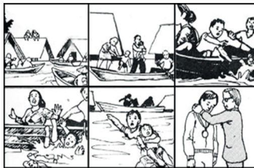
Figure 2. Sample activity: Week 4: Picture story: Put the pictures in order (Each frame is given to a different student and they put the story in order verbally without showing the pictures).