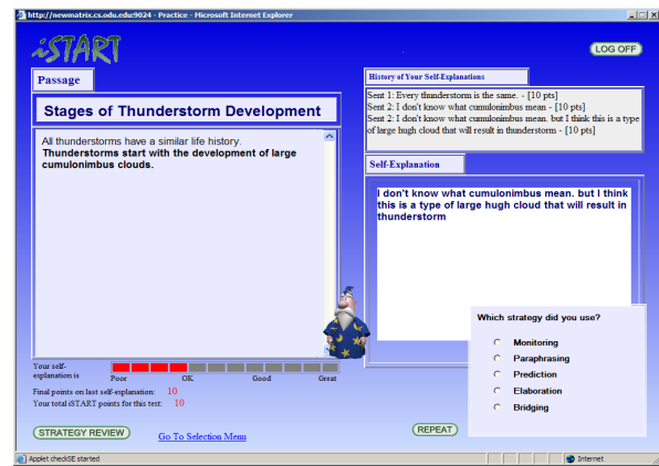
Figure 1. Screenshot of iSTART demonstration module

iSTART utilizes a localized (i.e., sentence-level) evaluation algorithm that assesses the quality of individual self-explanations and allows the system to provide relevant feedback [4].