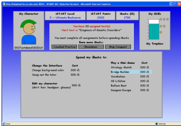
Figure 2. Screenshot of iSTART-ME selection menu

To address student disengagement, educational games and game-based features were incorporated within the system to develop iSTART-ME (iSTART-Motivationally Enhanced). Within iSTART-ME, the three main modules of iSTART (i.e., introduction, demonstration, and practice) remain relatively unchanged. However, the extended practice module contains a selection menu that allows students to interact with both educational games and game-based features (see Figure 2 for a screenshot of the game-based selection menu).