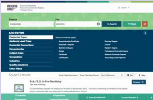
Users can search for credentials in any number of fields and further filter their results to show categories such as time of completion or whether a result is part of a separate but related credential.

The Indiana Commission for Higher Education (ICHE) , in collaboration with the Indiana Professional Licensing Agency , brought together 13 health professional boards to gain their perspectives on how to approach listing credentials in the Credential Registry. In addition to hundreds of health certificate and degree programs offered by state public institutions, credentials offered by secondary career centers are also made available. Indiana is also working with its Department of Workforce Development (DWD) to link to the department’s career exploration toolset. This linkage would allow users to view job market data and see what credentials they can earn to become competitive candidates. State policymakers are also working to link this information to DWD and ICHE employment and earnings data so job seekers can get a more complete picture of their expected return on investment. Such efforts are crucial in empowering students to make informed decisions on their education and career paths.