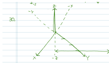
Figure 1: S13's first graph of y = 3 in \mathbb{R}^3 .