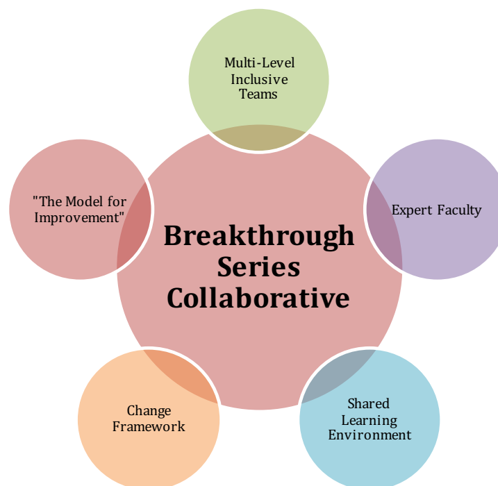
Figure 2. Five Key Elements of a BSC