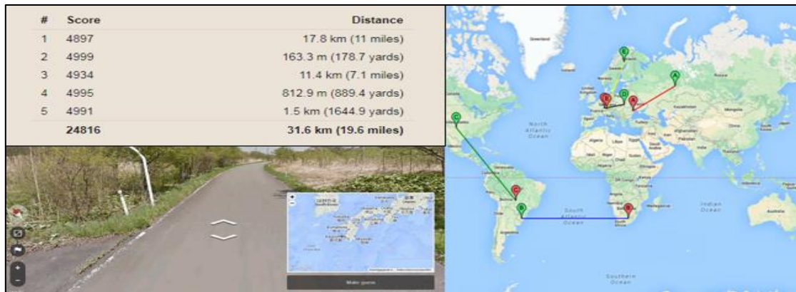
Image 1. GeoGuessr game screenshots

from tens of countries such as : Europe stadiums, 61 roads, USA cities, European Union, Game of Thrones, England, Premier League, Australia, Russia, Argentina, Brazil, Canada, Spain and Turkey (GeoGuessr, 2017).