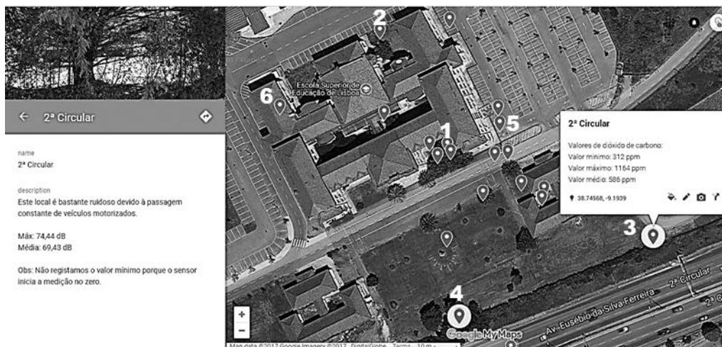
Figure 2. Collaborative Map of the Outdoor Environment of the Camp, with the Several Placemarks Created by Students. Two of the Placemarks, Near the Main Road Are Showing Their Content