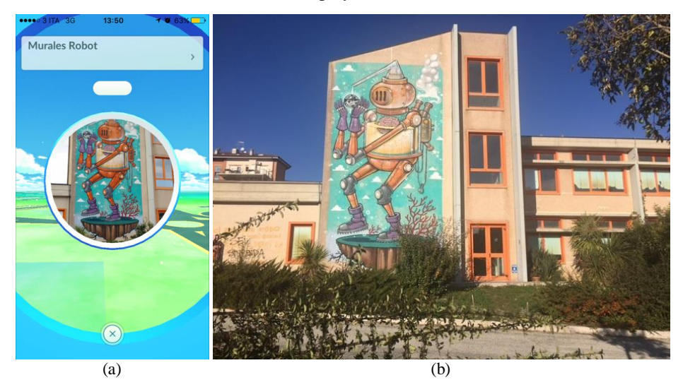
Figure 1. (a) A Pokestop corresponding to a piece of street art, a mural of a robot; (b) The robot on the wall of a school in Campobasso suburbs.

Pokémon Go is a free, location-based augmented reality game developed for mobile devices. Players use GPS on their mobile device to locate, capture, battle, and train virtual creatures (a.k.a. Pokémon), which appear on screen overlaying the image seen through the device's camera. This makes it seem like the Pokemon are in the same real-world location as the player.