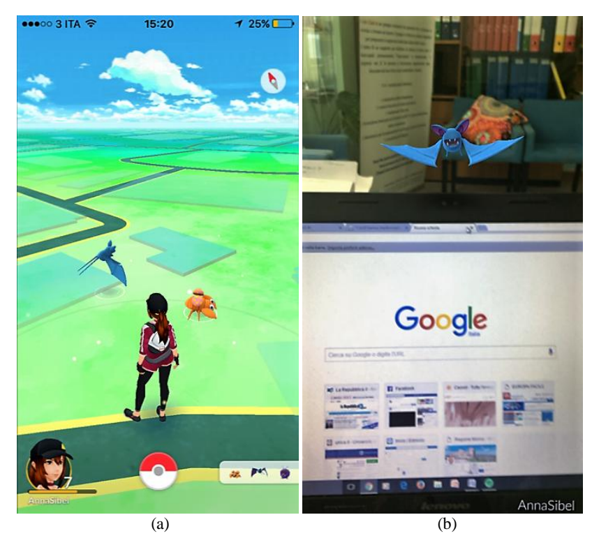
Figure 2. (a) The avatar AnnaSibel meets two Pokemon; (b) Zubat flies over AnnaSibel's computer monitor.

Pokestops are key points for socializing. They are special sites of interest – monuments, statues, portals etc. – where you can get Pokeballs and other useful tools. They are geo-localized like all the rest, but they open up and release their tools only when you get close enough to them. That's why you find groups of people hanging around Pokestops with their smartphones talking to each other about the game. Poke-stops also improve the knowledge of the sites, allowing (better: forcing) you to discover corners of your city you would have never seen otherwise.