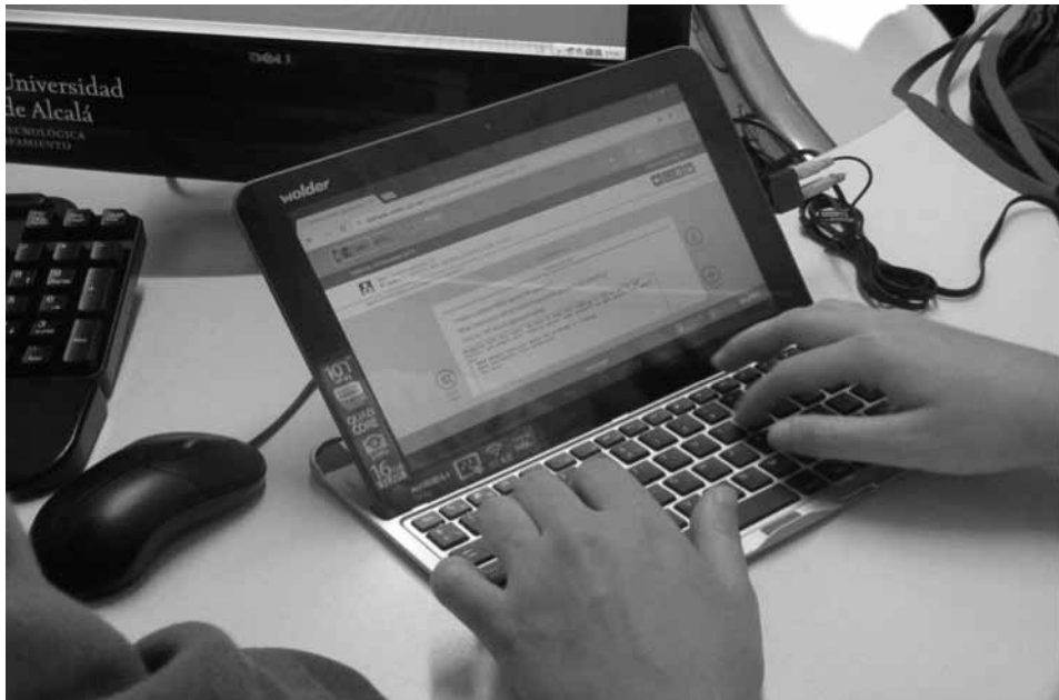
Figure 1. Research materials (desktop PC, tablet PC, headphones).

The programming language used is Moodle© PHP and the application can run on Linux©, BSD©, Mac OS-X© and Windows©. For the development of the application Linux© server with Apache© MySQL 5.3.2+ 5.0.25+ server are being used. The assembly is being developed in XHTML + CSS so that it can be properly displayed on mobile devices such as tablet PCs. The tablet PC used for this research was a Wolder miTab EVOLUTION W2 (figure 1) 10.1" HD IPS reinforced, with QUAD CORE, 16 GB ,and a QWERTY BT keyboard.