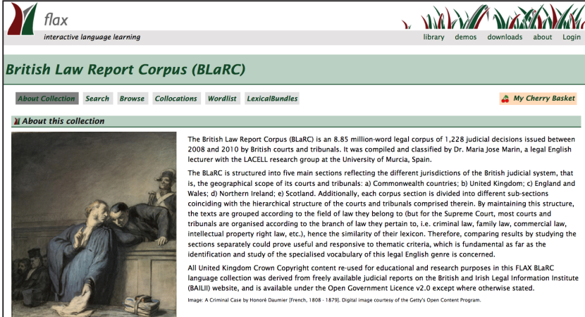
Table 1. Open resources featured in and linked to the FLAX Law Collections (Fitzgerald, 2014, section “Law Collections in FLAX”)