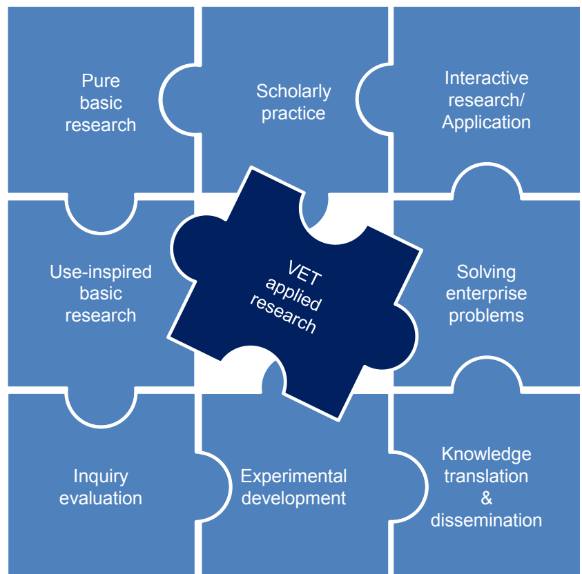
Figure 1 VET applied research: a missing piece in the innovation system

The VET sector is under pressure from the exponential increase in university places. This, on top of cutbacks to government funding over the last decade and a lack of clarity about VET's role now that it is squeezed between universities and schools, has led to a precarious position for the VET sector and the need to consider changes to traditional delivery. Establishing a viable place in Australia's tertiary education system will involve being able to strike a balance between creating and transferring knowledge, generating economic activity and helping to solve industry and societal problems. This capability is encapsulated in the term 'VET applied research'. We see VET applied research occupying a niche between academic research and industry innovation – and sometimes collaborating with both these endeavours. In essence, we are talking about research with a focus on solving real-world problems, both in industry and in VET practice. Such activity can create new knowledge, and/or use existing knowledge in new and creative ways.