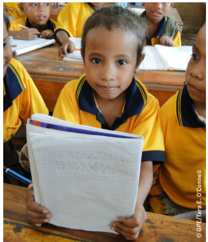
A student shows their work in math class in a primary school. Timor-Leste.

financial data availability, financial management and monitoring has helped mobilize domestic resources in partner developing countries. The average share of government expenditure on education grew to 16.62 percent in 2013 in GPE countries compared to