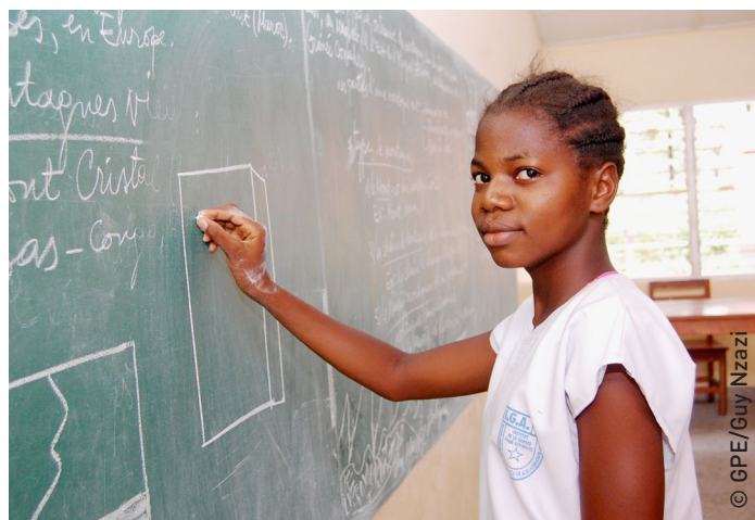
A student in lower secondary school in l'Institut de la Gombe open to blind students. DRC.