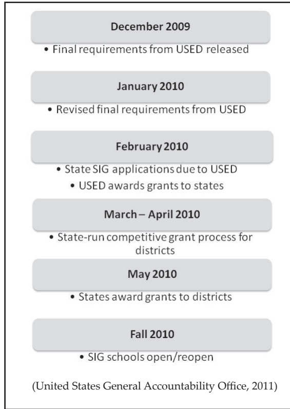
Figure 1: USED Timeline for SIG Implementation

The implications of the federal application and approval process were seen in Illinois; the state did not receive federal approval for their SIG plan until August 2010. As a result, the entire LTP selection and contracting process was delayed, and LTPs did not begin work until mid-way into the school year (SEA survey/interview). “Given these timelines, states were under considerable pressure to develop an adequate grant application and get funds to schools as quickly as possible” (McMurrer, Dietz, & Stark Rentner, 2011).