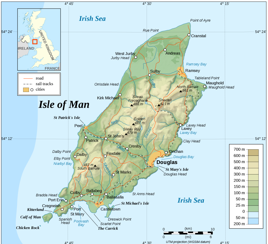
Figure 1: Map of the Isle of Man

The Isle of Man is situated centrally in the British Isles in the Irish Sea. It is an internally self-governing dependent territory of the British Crown. It is not part of the United Kingdom, but is a member of the Commonwealth, and has a special relationship with the European Union through Protocol 3 of the 1992 act of succession of the United Kingdom to the EEC (currently known as the EU), which was negotiated through the United Kingdom which acts for the Isle of Man in international affairs.