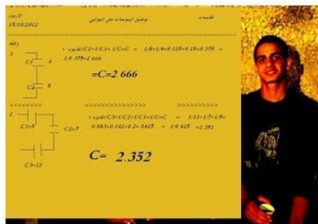
Figure 2 : The Personal touch made on the assignment

More choices for these students means infusing their personal feeling in their work. Student 21 liked to add his own photo (with special effects to some of assignments), same with student 15 and student 17 who changed the background and other setting for his blog.