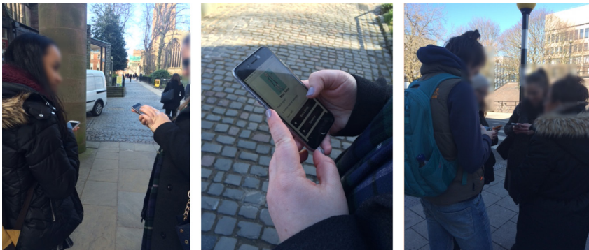
Figure 3. Play-test session in the city of Coventry

The pre-pilot play-test session involved testing Part 1 of the game. The participants were seven students (N=7) attending a Lower Intermediate Level Italian Language module at Coventry University (Common European Framework of Reference for languages Level A2). The students were selected as their knowledge of the Italian language was seen as allowing them to focus on usability and engagement aspects of the game (Layer 2/Layer 3 in Figure 2). Members of the research team accompanied the students, who were split in three groups (Figure 3).