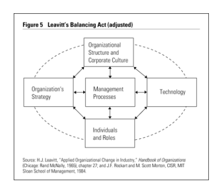
Figure 1. Rockart&Morton's Framework