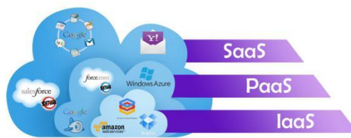
Figure 1. Three different type of Cloud computing services

There are three different type of Cloud computing services: 1) Software-as-a-Service(SaaS): is defined in [13], some defining characteristics are: web access to commercial software; Software is managed from a central location; Software delivered in a “one to many” model; Users not required to handle software upgrades and patches; Application Programming Interfaces (APIs) allow for integration between different pieces of software. 2) Platform-as-a-Service(PaaS): brings the benefits that SaaS bought for applications, but over to the software development world. PaaS can be defined as a computing platform that allows the creation of web applications quickly and easily and without the complexity of buying and maintaining the software and infrastructure underneath it. PaaS is analogous to SaaS except that, rather than being software delivered over the web, it is a platform for the creation of software, delivered over the web [14] . The example of PaaS include SAE, Amazon and so on. 3) Infrastructure-as-a-Service(IaaS): Infrastructure as a Service (IaaS) is a way of delivering Cloud Computing infrastructure – servers, storage, network and operating systems – as an on-demand service. Rather than purchasing servers, software, data center space or network equipment, clients instead buy those resources as a fully outsourced service on demand [15] .