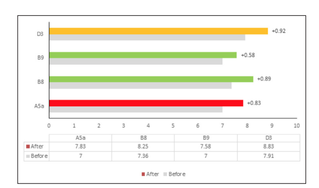
Figure 2. Least noticeable perceived improvement

Minor perceived improvements were reported in items relating to their ability to support students (B9), matching students (A5a), integrating TC topics into regular classes (B8) and willingness to reach a compromise in how the TC is designed (D3) (Figure 2).