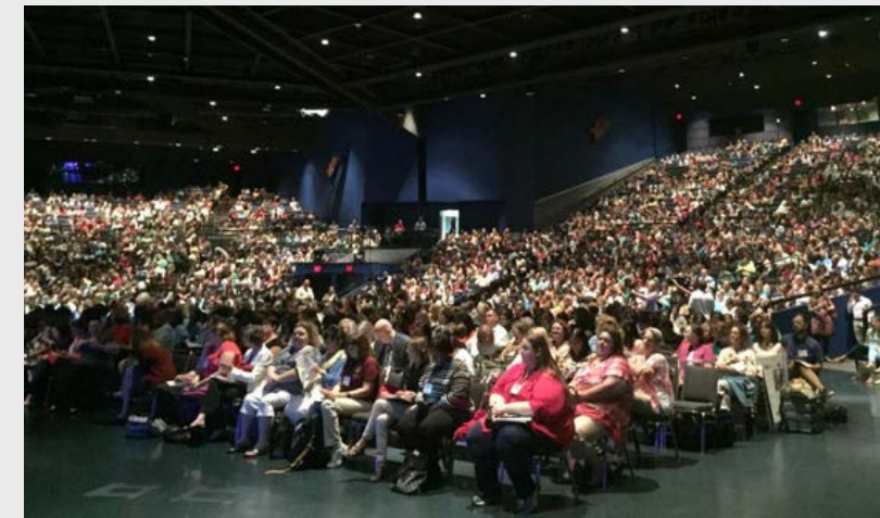
Summit opening session in 2015.

Still, getting teachers to view evaluation as a tool for support will require further effort by the state. At the 2015 Teacher Leader Summit, a small group of teacher leader advisors New America interviewed said they appreciated LDOE’s efforts to make evaluation more about development and generally felt support in implementing the new academic standards. 63 However, in order to better focus their improvement efforts, the group wanted to receive more frequent and higher quality feedback on their practice, and cited school leader development and observation frequency as critical needs for the state to address. 64 In addition, the group valued the opportunity to set professional growth goals but found the required development plans to be more compliance-driven than meaningful, likely due to a need for stronger school leader training and guidance.