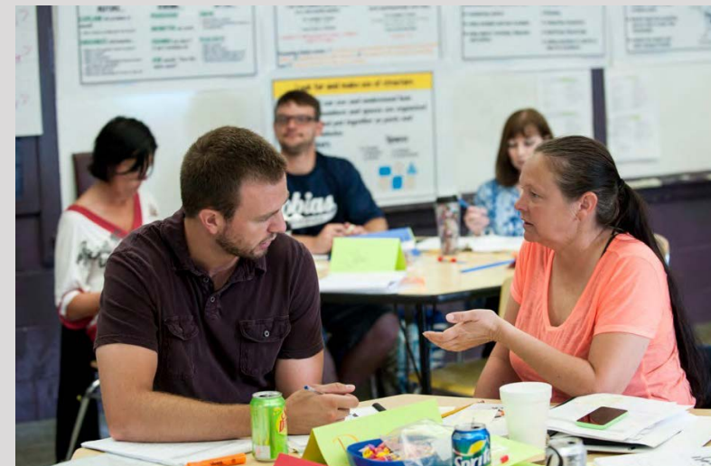
Instructor development in 2015.