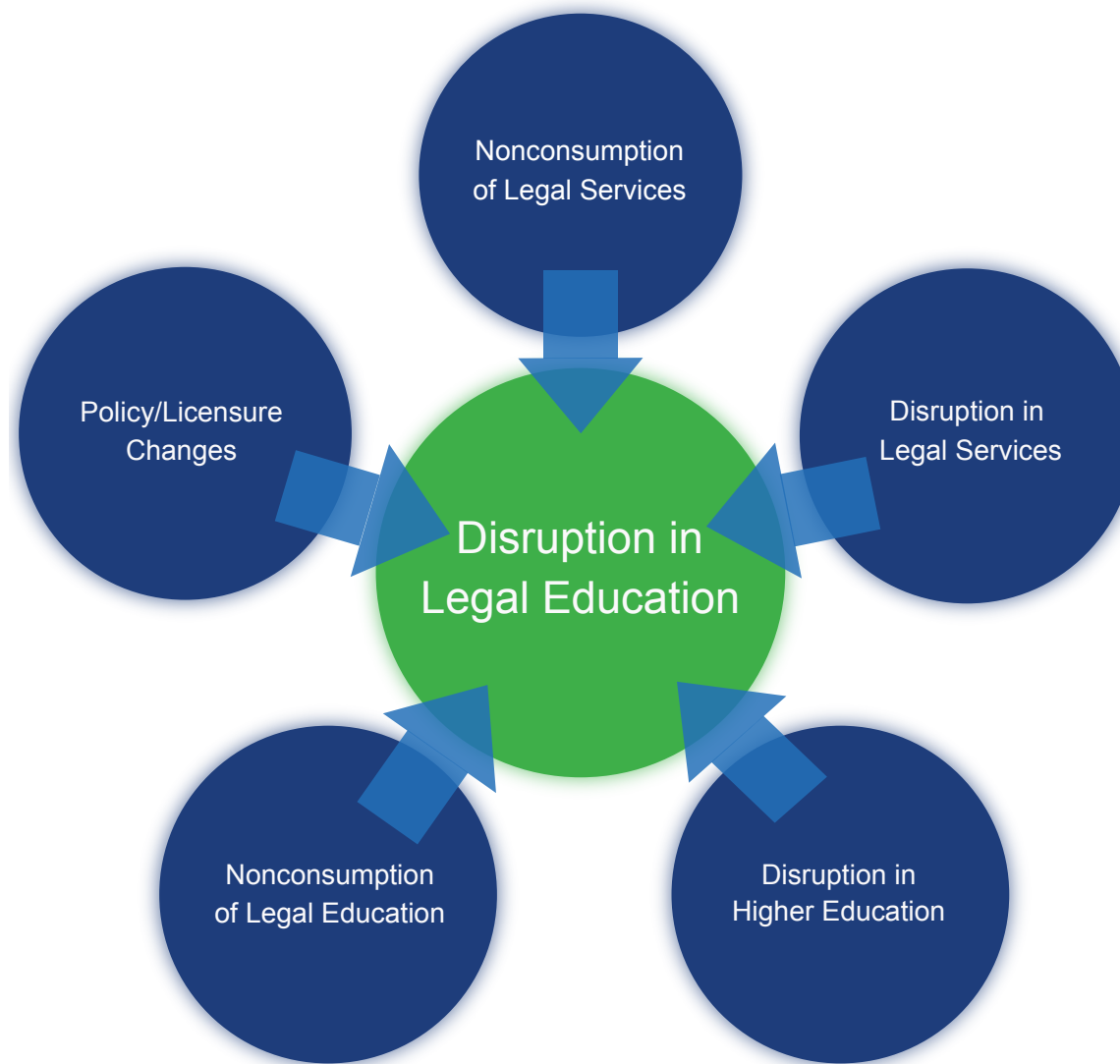
Figure 1. Conditions that create room for disruption