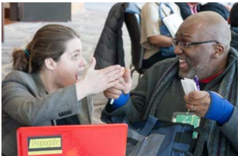
Teacher provides feedback to an entrepreneur at an ed tech summit in Baltimore

Random assignment to create the comparison groups is the preferred approach but is not always feasible, so other matching techniques are often used. It is important to understand and acknowledge their limitations when making claims about the impact or effectiveness of your app or tool.