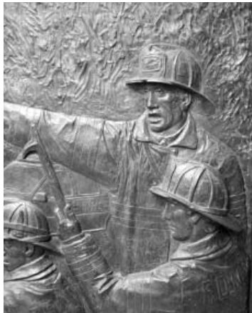
Detail of brass memorial on Firehouse 10 near WTC “dedicated to those who fell and to those who carry on.”