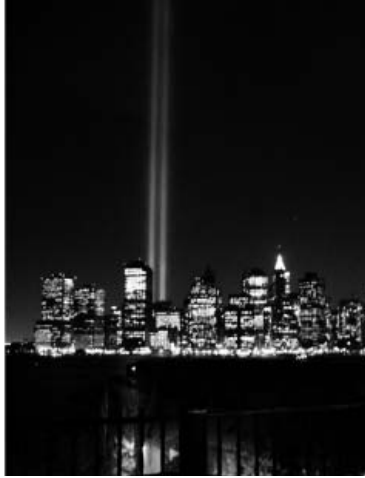
Beams of Light memorial on September 11, 2007.