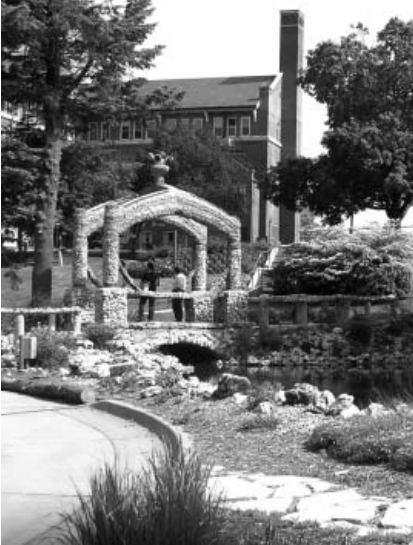
Participants explore campus as text at Mount Mercy College.