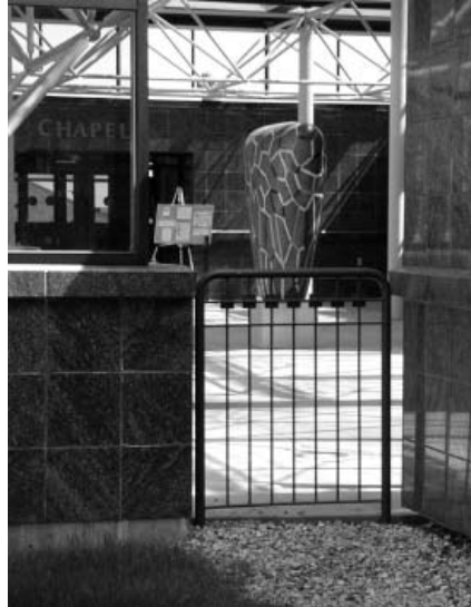
Borders, paths, landmarks, and nodes on the Mount Mercy campus.