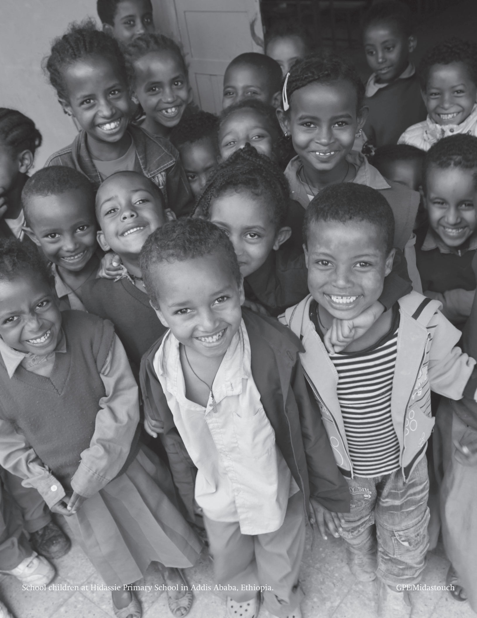
School children at Hidassie Primary School in Addis Ababa, Ethiopia.