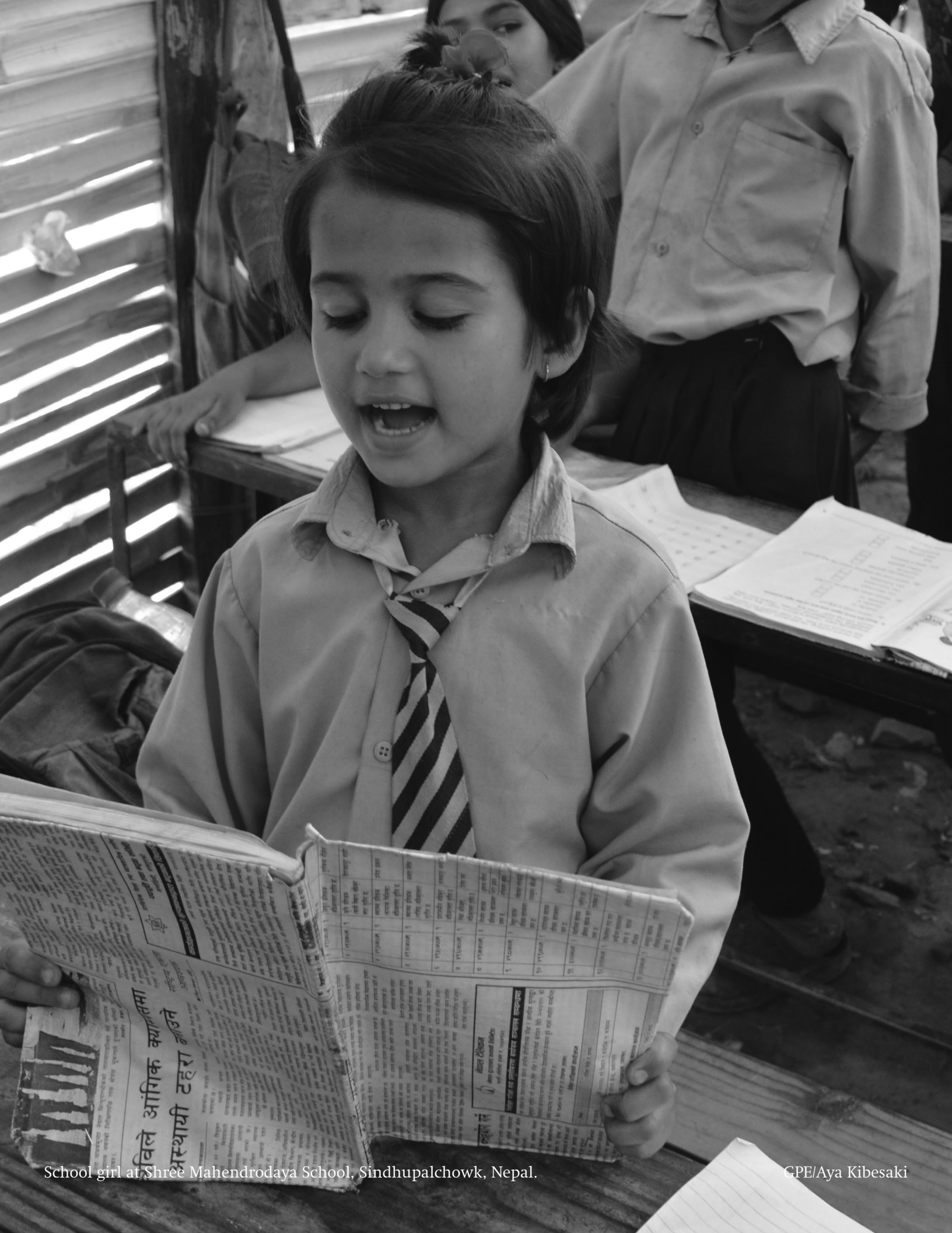
School girl at Shree Mahendrodaya School, Sindhupalchowk, Nepal.