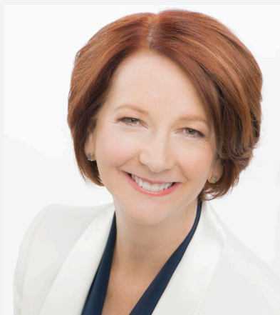
JULIA GILLARD Chair of the Board of Directors