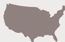
SELECT SAT STATES

Changes in 4-year college-going rates in Maine were compared to changes in three control groups: (1) all SAT-dominant states, (2) New England states, and (3) a synthetically-constructed Maine. Maine's actual change in 4-year college-going after the policy change is statistically larger than all three control groups.