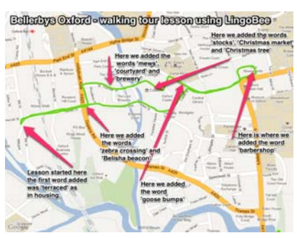
Figure 3. LingoBee activities: a walking tour of the city

The second trials in both case studies 1 and 2 had more active involvement from the teachers. "Second language acquisition is best promoted through the utilization of tasks focusing the learner on meaning" (Kiernan and Aizawa 2004), as quoted in (Chinnery 2006). Case study 2 included activities such as a scavenger hunt and a walking tour of the city using LingoBee as shown in Figure 3 . The second group had a number of LingoBee lessons before the walking tour, they all enjoyed it very much and one commented that it helped him to understand when and where he could use LingoBee. "Since April/May I used LingoBee more frequently for taking pictures after the lesson with the walking tour used pictures more out and about."