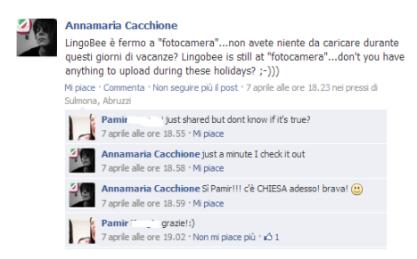
Figure 4. Facebook support in case study 1, LingoBee related activity

In case study 1, it was observed that the first group was not very motivated in learning Italian. However, the second group was selected based on their level of motivation and this may have been a factor in their increased participation. In addition, a Facebook support group was created as an additional support outside of the classroom. This was initiated by one of the Polish students to communicate with other students in the Italian L2 course (the group in fact is named "Corso di lingua italiana"). The teacher/researcher joined the group and also used to provide notices about the lessons. Only a few posts related to LingoBee, however it seems to have had a positive impact on the use of LingoBee by boosting the overall guidance and support available for the students. Figure 4 shows activities on the Facebook support where the discussion was related to LingoBee.