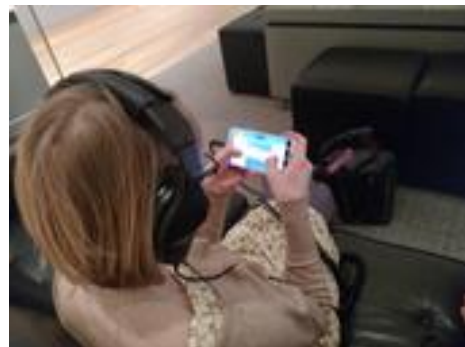
Figure 4. Companion in Pilot Study

In the TagAlong system condition, participants are connected with a live audio stream, and can use the system to exchange images and annotations of the subject matter in the wearer's environment as shown in Figure 3 and Figure 4. The wearer's interaction is hands-optional, since she only needs to use her hands when she wants to send an image. No physical posture change is required for her to shift focus between the system's visual feedback and the world, and the input device can be operated eyes-free.