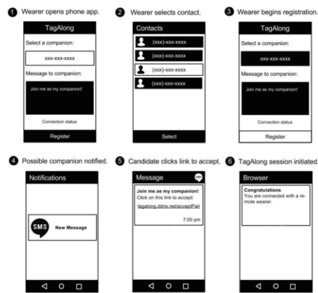
Figure 2. Interaction Initiation Flow