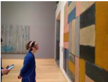
Figure 3. Wearer in Pilot Study

A remote art expert interacts informally with a non-expert to convey knowledge about a specific work of art, which the non-expert is in the presence of. No guidance is given to either party about how to initiate the dialog. They interact using one of three conditions (i) TagAlong with live audio, (ii) video streaming on a mobile phone with live audio, and (iii) co-present, face-to-face interaction. In the dialog that they have, either party can determine the subject, questions can be asked, and clarifications requested.