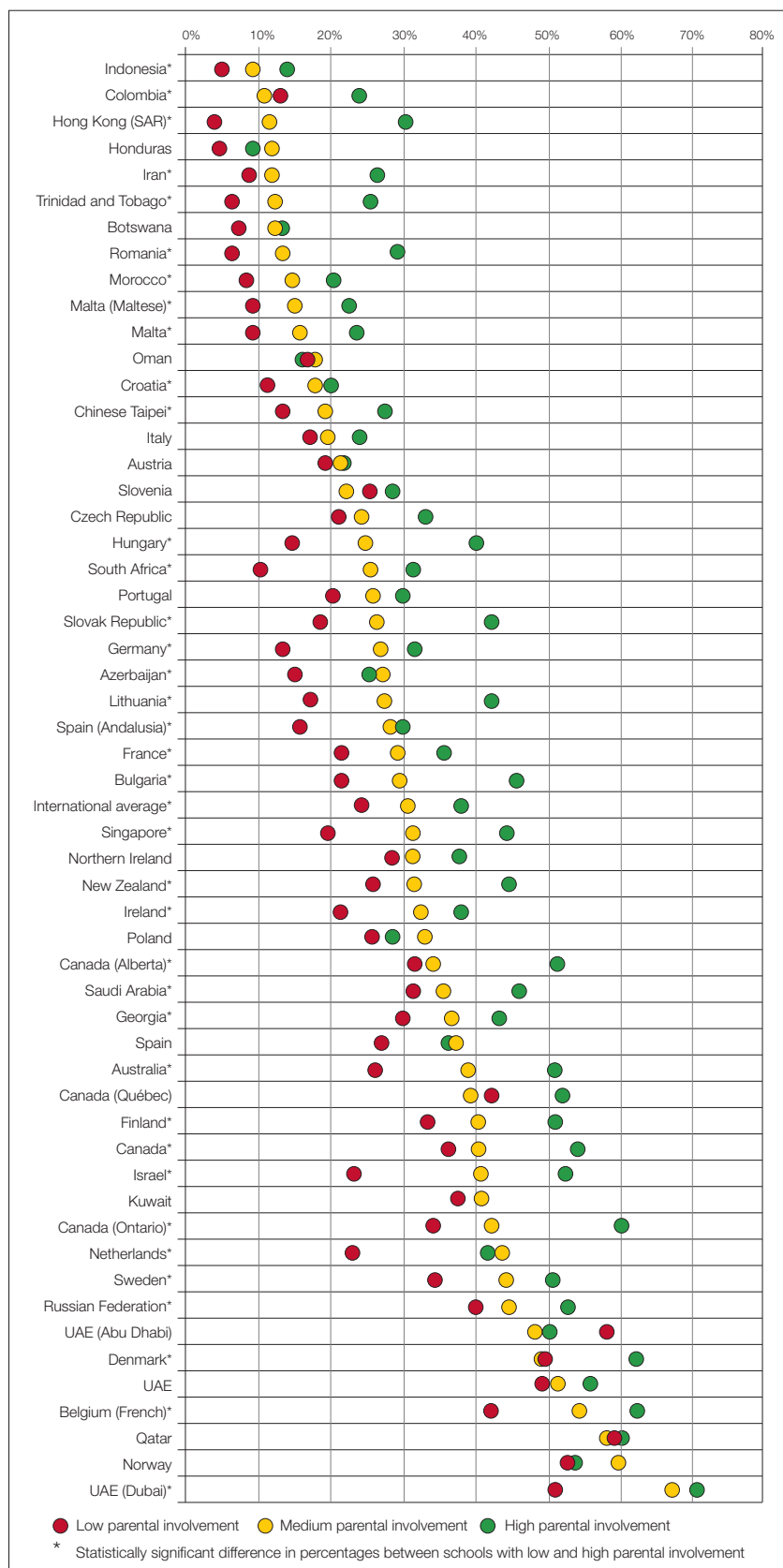
Figure 2: Percentage of Grade 4 students in schools with different levels of parental involvement who had at least one parent with a university degree, by country: PIRLS 2011