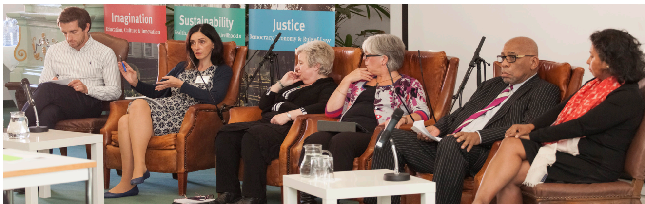
Members of the European Access Network present their work to the Salzburg Global Fellows