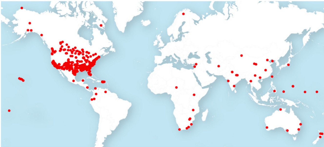
Colleges and universities that serve “students at the margins” either by mission or by demographic. Research by the Penn Center for Minority Serving Institutions

designations are more established than others. There are those that are self-made while in other contexts, identification is discouraged due to past injustices. Participants agreed that, although precarious and at times rigged with stigma, when used strategically, identity can ensure programs have maximum impact. Therefore, identities should be additive, counteracting any disadvantage students already face. However, for general use, students should be the prime agents in defining and validating what it means for them.