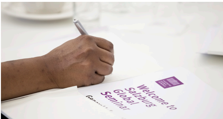
Group work in the Chinese Room