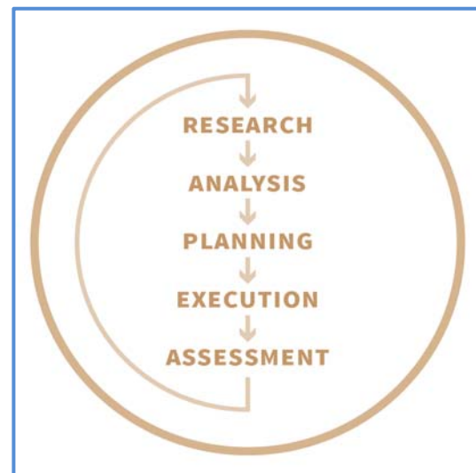
Figure 2. Communications Feedback Loop

The feedback loop depicted in Figure 2, excerpted from the strategic communications framework (Figure 1) illustrates a thorough process for SEAs to use to evaluate the effectiveness of their outreach strategies as a means of proactive rather than reactive communications. Doing so would allow the SEA to articulate goals and strategies, identify interim or benchmark goals, plan and execute their strategies, and then assess their effectiveness and build next steps. To date, their processes were very much organic and not executed within a larger process improvement strategy.