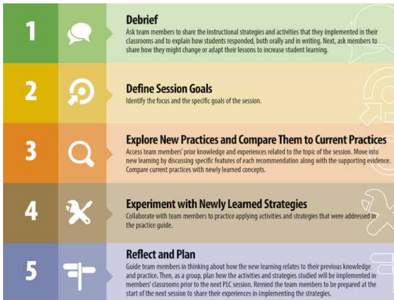
Exhibit 1: Five-step process for PLC sessions