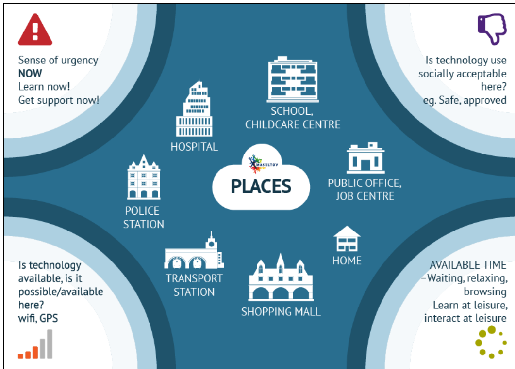
Figure 2. A visualisation of the range of affordances that may be associated with particular places that a MASELTOV service user is likely to encounter during their daily activities.

recent research due to the presence of a range of affordable and compact sensors built into the current generation of mobile phones. Sensors which derive information about the device's use can also enable contextual support, for example utilising accelerometers in phones to interpret the activity currently being undertaken by the user, and providing suitable resources in response. Bristow et al. (2004) identified that body position (e.g. sitting, standing, or walking) was a key aspect to defining the context of the user when considering what resources were appropriate to recommend to them. Here we have highlighted place as an example. We have also unpacked the other key elements of the framework in other secondary visualisations.