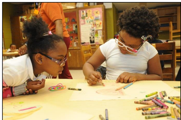
Figure 3. The Community Schools Superintendents Leadership Council

Superintendents Leadership Council is a network convened by the Coalition for Community Schools and the School Superintendents Association (AASA) to spotlight leaders and provide a peer support group for superintendents who are implementing the community schools strategy district-wide. The group was convened in June 2013 to discuss its role in expanded learning opportunities. A full list of Council superintendents and those attending the meeting is available in Appendix IV.