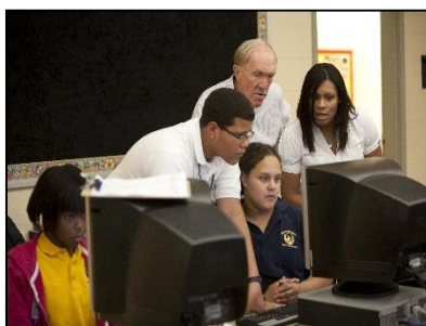
Figure 10. Hartford, Connecticut: Alignment between School Week and Weekend Programming

For the additional assistance to be productive, coordinators work closely with teachers, administrators, and partners to link the weekend and weekday curricula. The alignment between in-class academics and the extra programming allows teachers to make the weekend sessions productive.