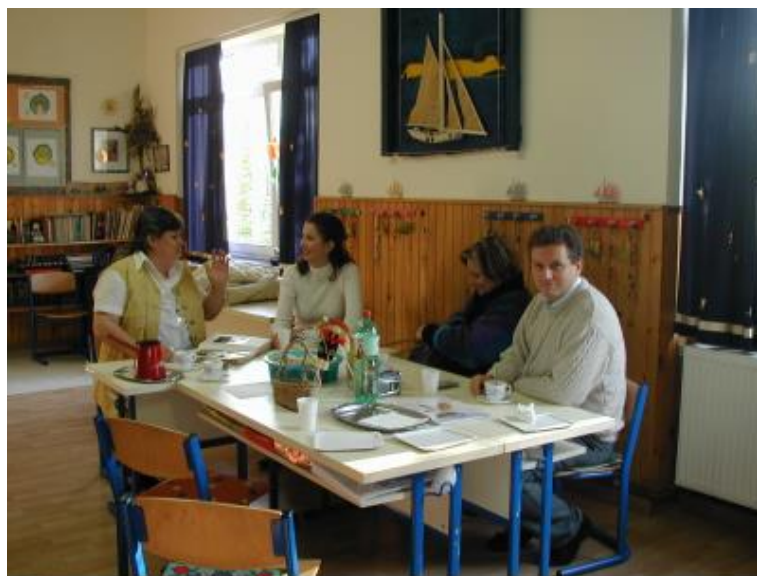
Figure 2. A meeting of teacher action researchers