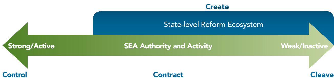
Figure 3. SEA Authority and the 4Cs

Instead of doing “more, better,” tomorrow’s SEA should do “less, better.” The SEA must empower the field rather than trying to unilaterally lead it. 68 Let’s look at how this approach might work in practice.