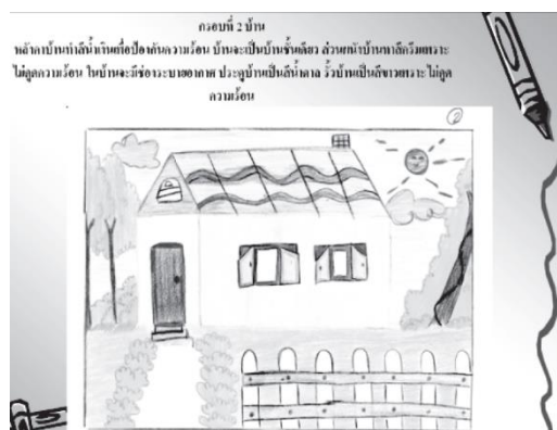
Figure 4. The learner's artifact "The Energy Saving Home" designed on PowerPoint from Ms. Cha's classroom in science grade 9

The researchers found that the PBL using ICT enhanced the learners' five key competencies and learning outcomes. The results of the study revealed that the learners were developed in key competencies: