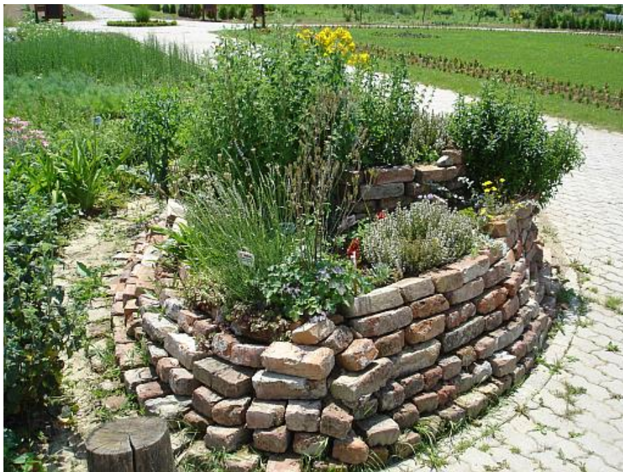
Figure 4. Spiral of medicinal herbs and spices in the garden

With the arrival of spring, we planned to go out in the school garden, our outdoor classroom ( http://www.youtube.com/watch?v=JsTekfuxlak ). The garden is composed of four departments (practical exercises): flowers, forest, vineyard vegetables and gardening. The gardening department is not regulated in the regular way, rather it represents a garden of biological diversity. Also, there are some creative details in the garden, such as a spiral of spices and medicinal plants (Figure 4) that are rarely found in school gardens. The students feel free and have a chance to be creative in this area (see http://www.youtube.com/watch?v=BmWK5pwVdBw ).