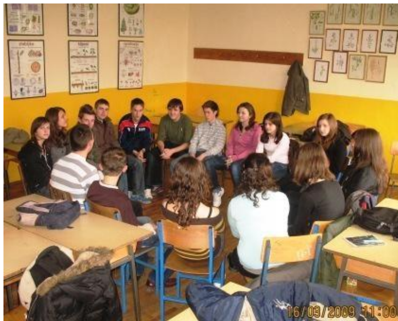
Figure 1. The discussion in the circle

The students assessed this activity at the end of the lesson by completing an evaluation sheet. It consisted of several open-type questions. When asked what they thought of the organisation of the lesson, the students responded that they felt uncertain in the beginning and did not understand what it was about. However, they explained that as the lesson progressed they welcomed the opportunity to use independent thinking skills in discussing the assigned provocation and that they enjoyed a different way of learning. They also expressed their satisfaction with communicating in groups. Many of the students liked this way of learning and they said that they would prefer if other teachers also worked in this way.