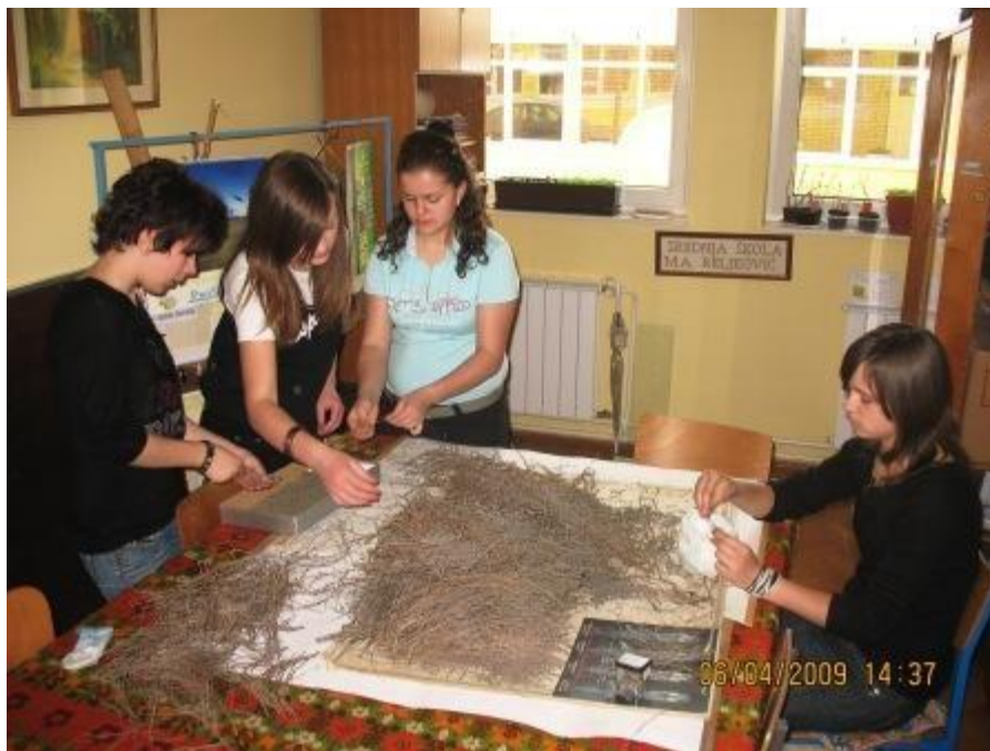
Figure 5. Students are preparing the spice

As they had freedom of choice, some students chose to remain in the classroom and learn the plant production content from textbooks.