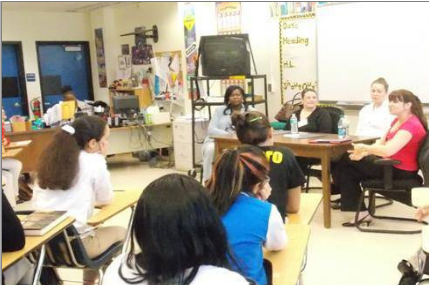
Women in STEM Panel

School and business partnerships help supplement lessons and facilitate teaching and learning when done correctly. In the area of STEM education, the need for resources and partnerships is even greater due to the current and projected job outlook. STEM related jobs are on a long-term rise and there is a high demand nationally and internationally for individuals with STEM educations. In order to prepare for tomorrow's demand of STEM occupations, we must prepare K-12 students today.