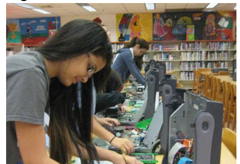
Female students participate in gender-specific workshops, engage with female professionals in STEM careers, work side-by-side with the boys in engineering and chemistry competitions, and are mentored through Women of Tomorrow.

One such partner is Zoo Miami which provided students with real-life experience to develop interpersonal and professional skills in addition to application of scientific concepts. Through this