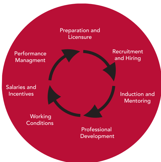
Figure 1. Educator Career Continuum

Copyright © 2008 Learning Point Associates