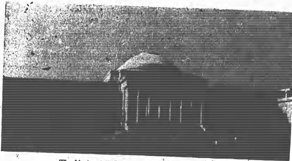
The National Gallery contains a fine collection of art.

A third Commission works effectively with the Fine Arts and the Zoning Commissions. It is the National Capital Park and Planning Commission. It was created by Congress in 1926 to offer advice regarding an extensive park system, including the changing of old highways and the laying out of new ones. This Commission buys all of the lands for parks and playgrounds with money appropriated by Congress but largely paid for through local taxes. The lands purchased for the parks are placed under the control of the Department of the Interior. The Recreation Board controls many of the playgrounds. The Commission's regional planning is done with the cooperation of two States and four counties.