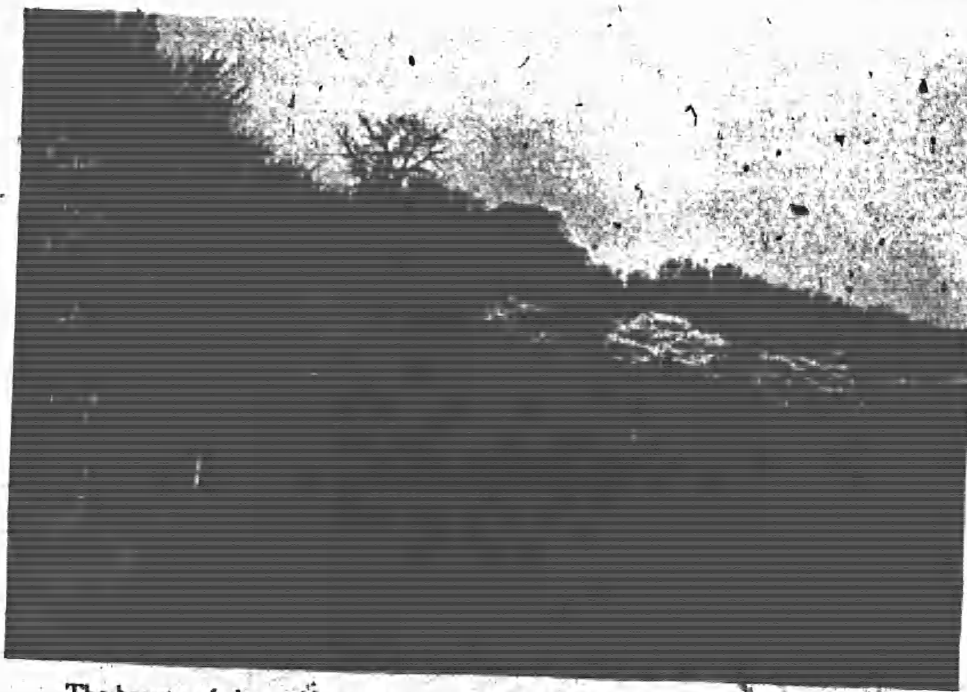
The beauty of cherry blossoms around the Tidal Basin is a cherished memory.

The workers in the Capital City take advantage of the fine recreational opportunities. They enjoy several parks, Rock Creek, National Zoological, East and West Potomac, the Mall, and the Botanic Garden. There are several hundred smaller areas of playgrounds and athletic fields, and the small parks at the intersection of city streets are conveniently located for leisure hours. There are indoor recreation centers, swimming pools, movies, and countless other places where one may relax.