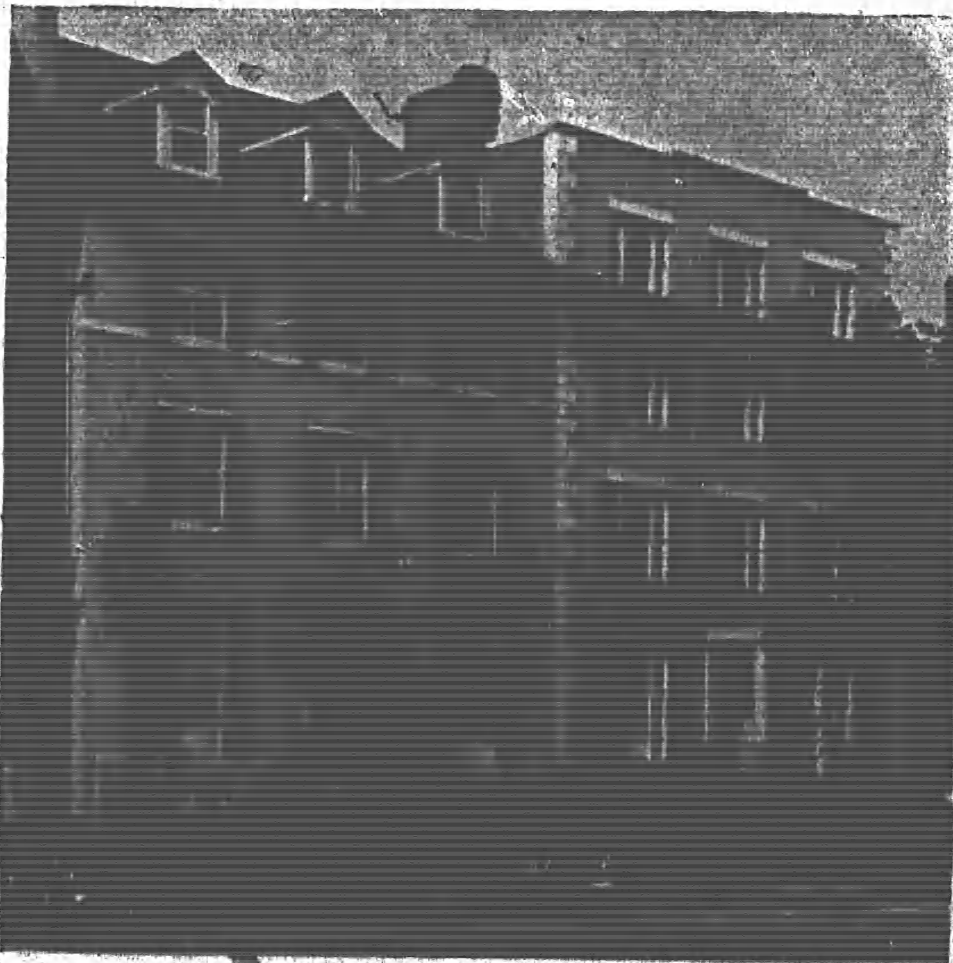
Your President lives temporarily in the Blair and Blair-Lee Houses.

Your sight-seeing guide will show you the Headquarters of the National Military Establishment in the Pentagon, across the Potomac. In this largest and most unusual office building in the world are the Departments