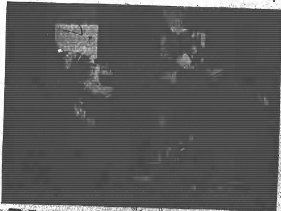
The tropical patio of the Pan American Union is a bit of Latin America.

Among the busts look for Simon Bolivar, the George Washington of Venezuela. The guide will show you the big assembly room, the Hall of