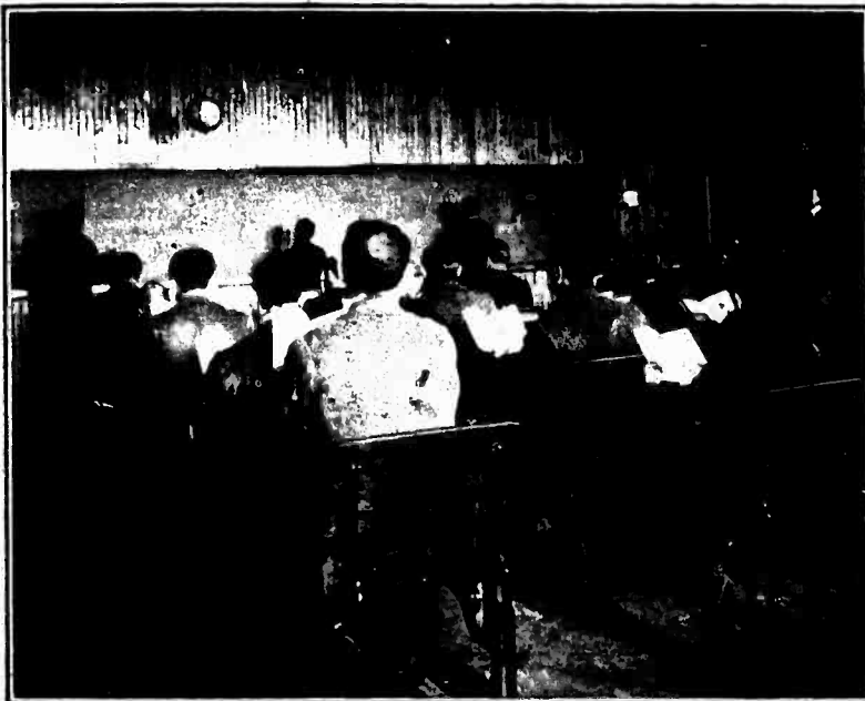
A. "STANDARD TWO" CLASSROOM, SING SING PRISON.