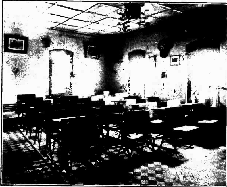
A. A SCHOOLROOM IN CLINTON PRISON, N. Y.