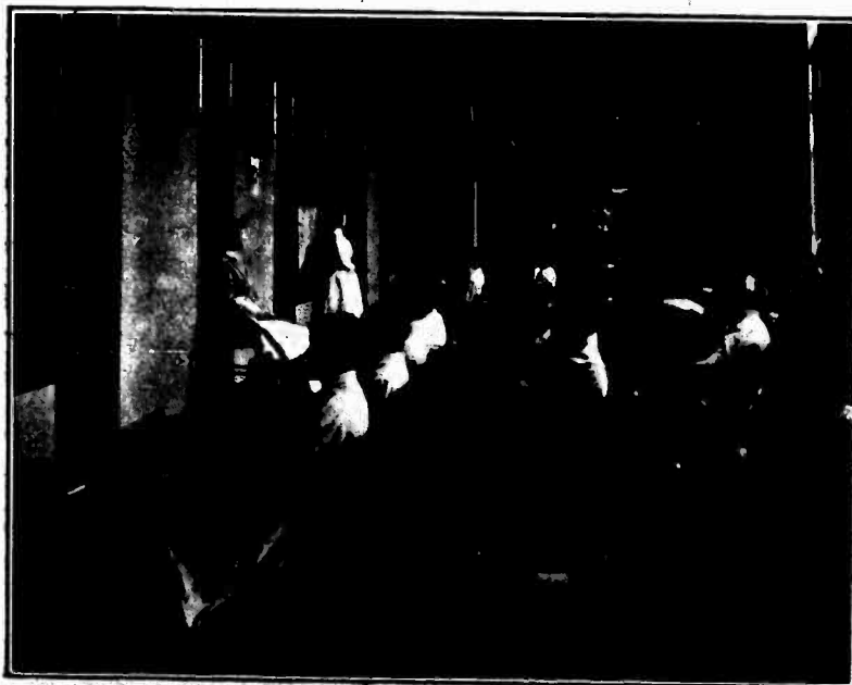
B. WOMEN'S PRISON SCHOOL, AUBURN, N. Y.