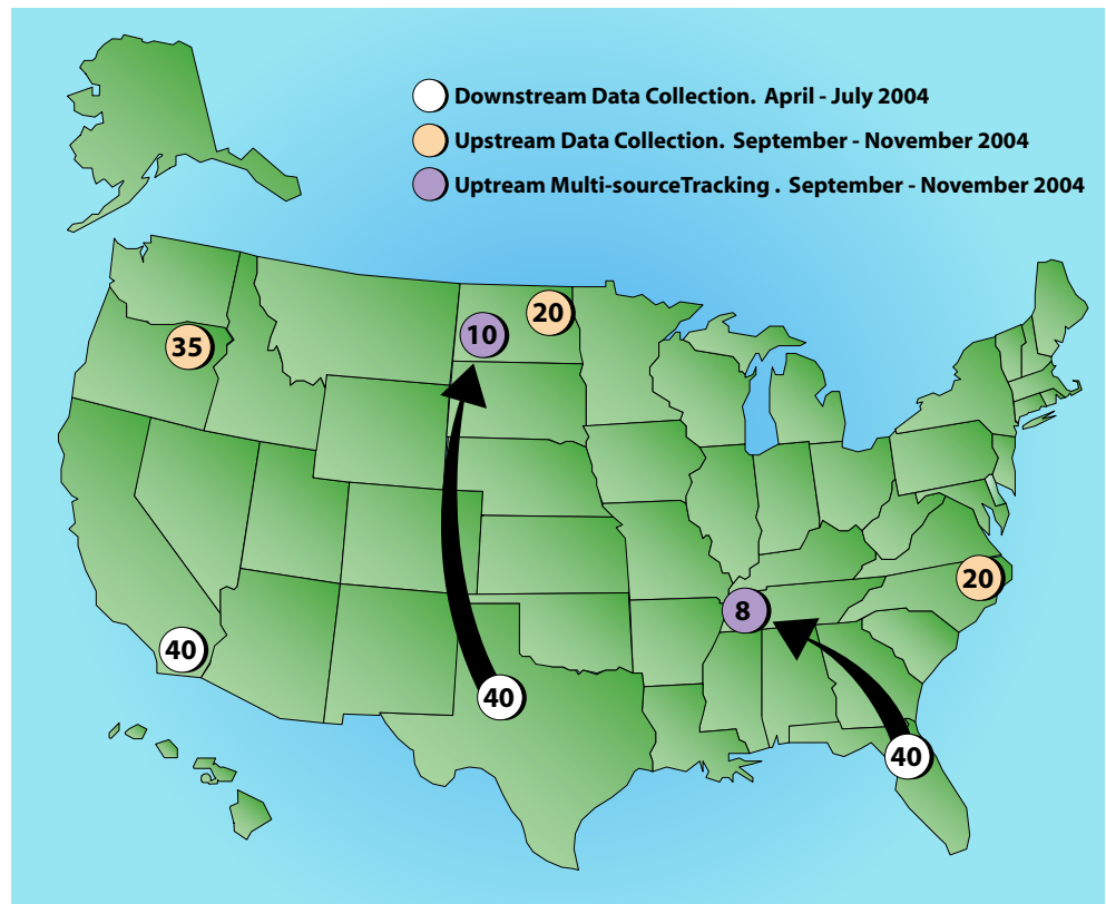
Figure 1. Migrant Streams and Planned Data Collection Timetable

The “tracking” group of families was divided into two subgroups for consideration of two tracking methods. The multi-source method (N=18) for tracking families involved contact with program staff from both the sending and receiving MSHS programs and telephone contact with family members and the parents. The 18 families tracked with the multi-source methods were selected because of their stated migration plans: these families planned to migrate to 2 geographically clustered locations which simplified follow-up efforts. 2 The single-source method (N=61) 3 of tracking families involved only contact with program staff from both the sending and receiving MSHS programs.