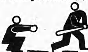
Construction of athletic fields