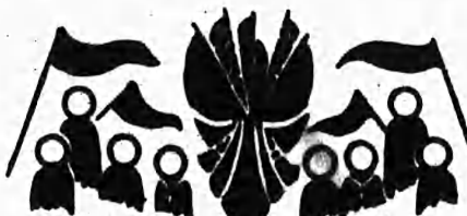
Festivals, fairs, contests and regional expositions