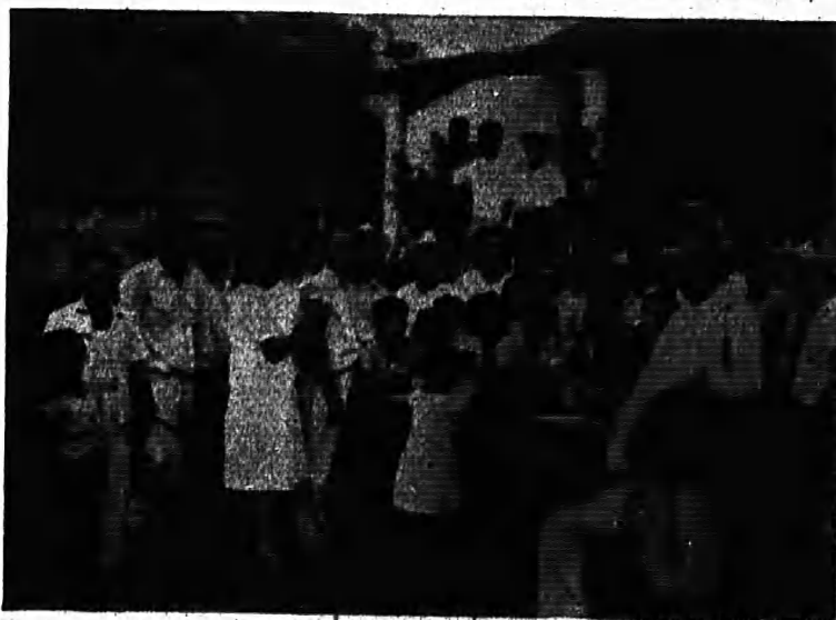
Vaccination against smallpox by the mission nurse.