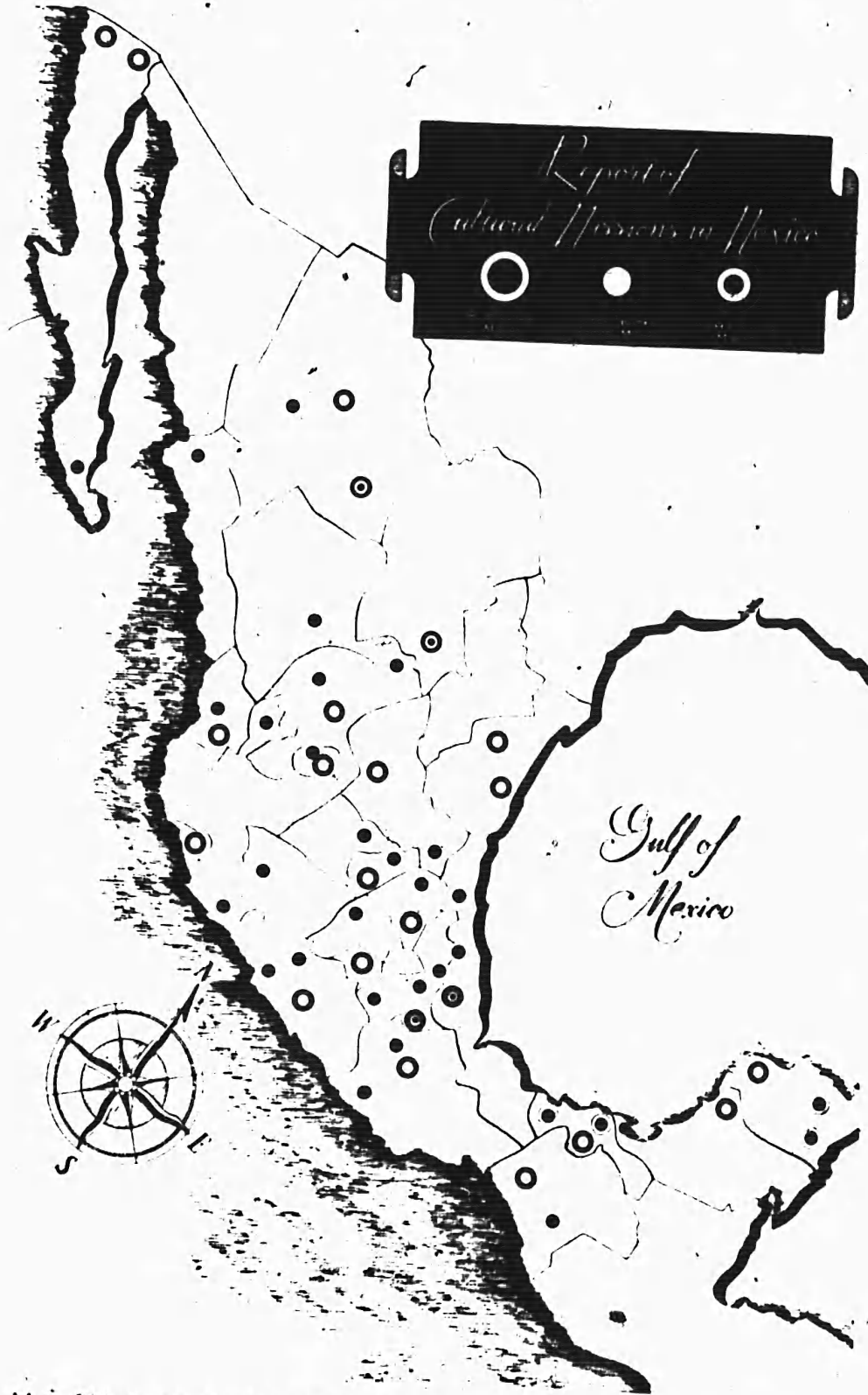
Map of Mexico showing the location of the three types of cultural missions which were in operation in 1943.