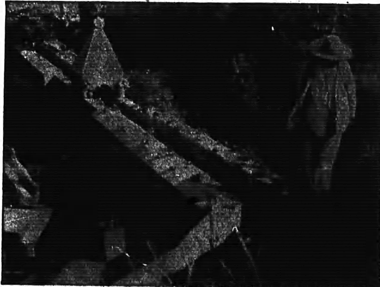
An aqueduct, built to replace the hollow log (left) formerly used.