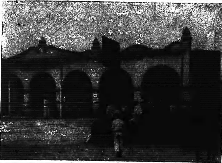
A school built by the citizens of a community in Tlaxcala.