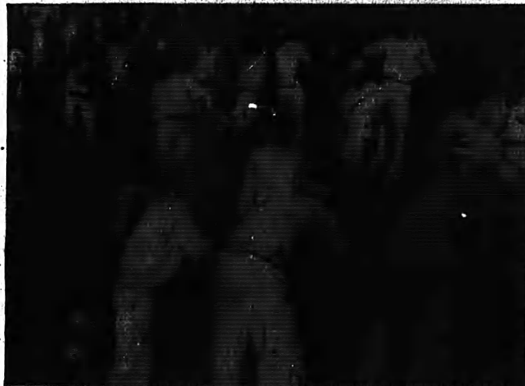
The entire village of Zacatepec Mixes, Oaxaca, builds an athletic field.