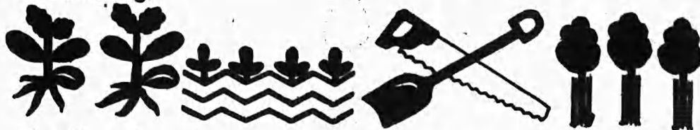
Taught seed selection

All missions with the exception of Cuautempan, Puebla, accomplished the following: