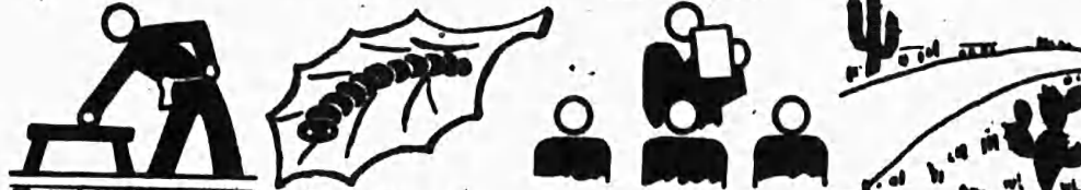
Established carpentry shops