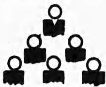
Social and cultural campaigns