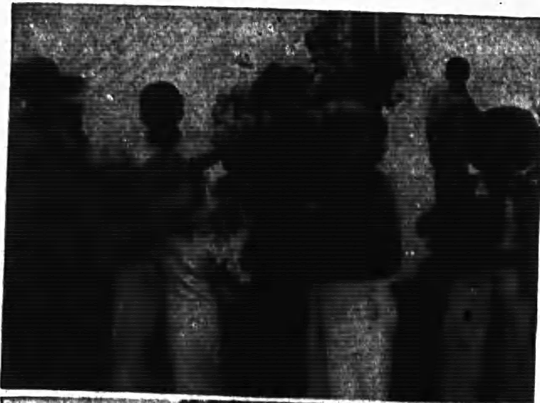
A group of cantoneros entertain in a rural community.