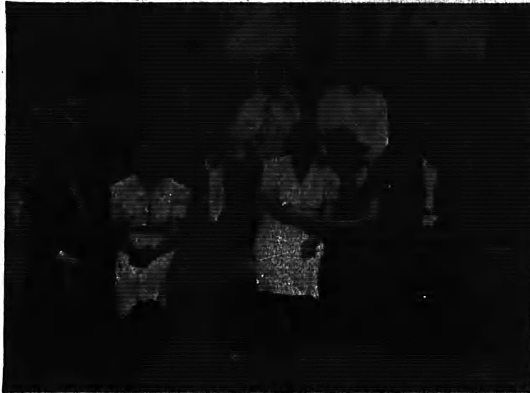
Health committee of a remote village in Chihuahua.