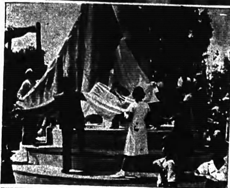
Raising the Flag on a new monument built in Pabellón, Aguascalientes.