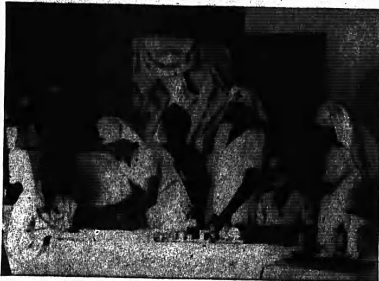
A first-aid group of the mission at Coyutla, Vera Cruz.