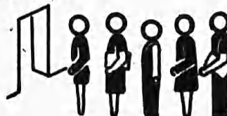
Organisation of schools