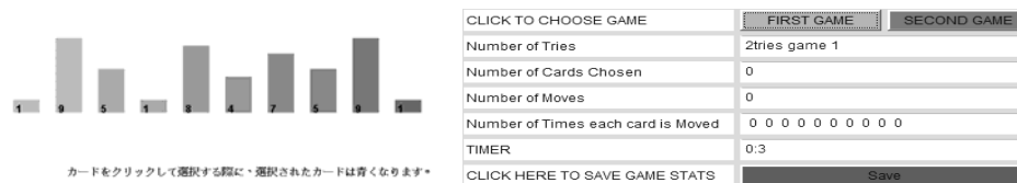
Figure 2. Unsorted cards and data boxes in Card Sorting

Fundamental algorithms, commonly taught in introductory computer science were designed as games that can simulate how the algorithms work. The first set of games is Card Searching which includes Linear Search and Binary Search. The goal is to locate a certain number from among ten (10) numbered cards. The next is Sorting games, where the goal is to simulate Insertion Sort and Selection Sort while sorting ten numbered cards in ascending order. The third game is Maze Tracing which attempts to simulate how breadth-first and depth-first search algorithms work. The last algorithm, Tower of Hanoi, checks the student’s ability to think recursively. It was not implemented among the high school students because recursion is not covered in their course syllabus. Figure 2 shows the screen components of Card Sorting.