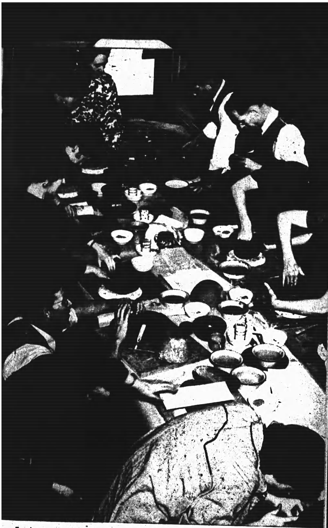
Teachers get the "feel" of working with materials as they create Mexican pottery.