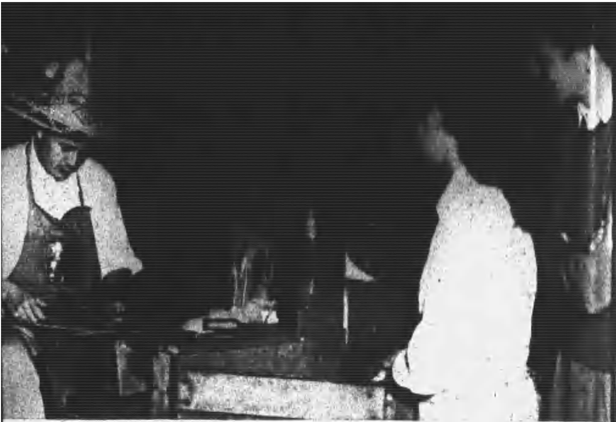
Pupils watch a Mexican artist at work.