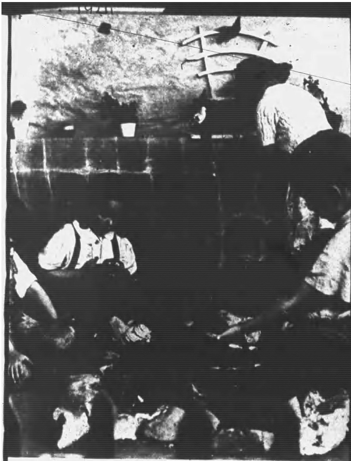
Children dramatize Mexican home life.

A seventh-grade geography project on Mexico in East Grand Rapids, Mich., provides for the study not only of the geography, but also of folk customs and festivals, food, dress, songs, and dances, art and handicraft, games, and amusements. In addition, there is a unit on Spanish words and phrases, greetings, expressions of courtesy, expressions relating to school activities, numerals, days of the week, months, time, weather, and colors, and simple Spanish songs and poems.