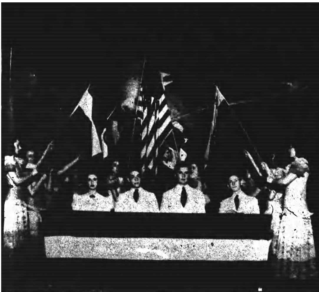
"Court of the Democracies," a commencement pageant summarizing a unit of inter-American experience.

ship, was participated in by 8,000 children and attended by 10,000 parents and friends.