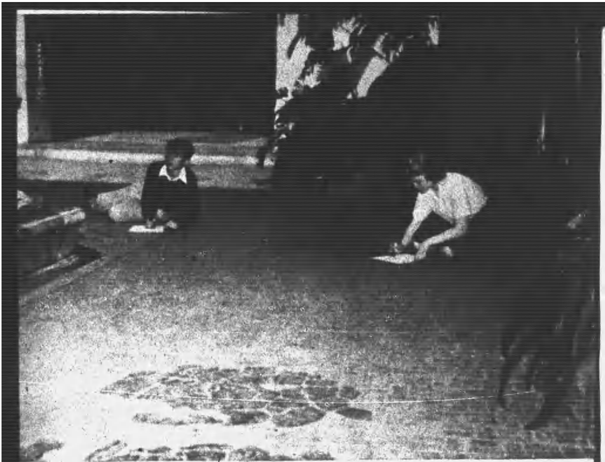
Pan American Building offers art inspiration to school pupils.