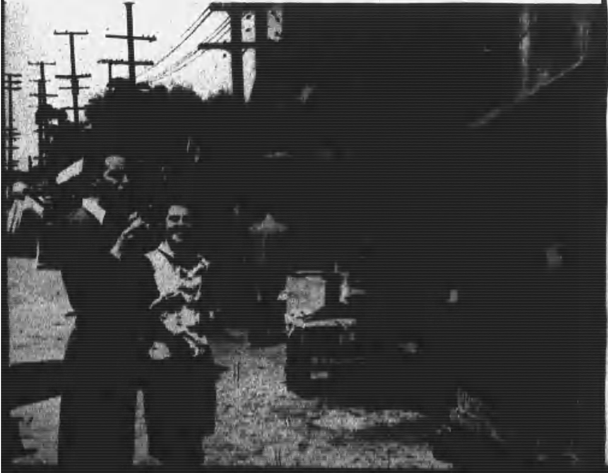
Students enjoy Mexican food.