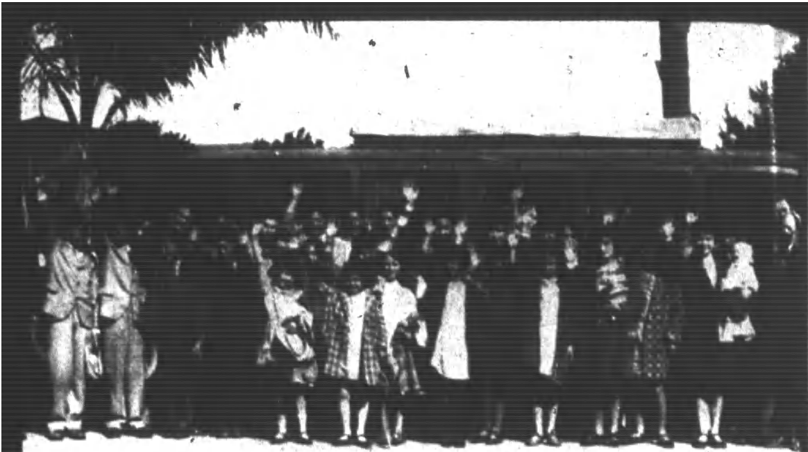
Good-will tours bring Mexican boys and girls to the United States.