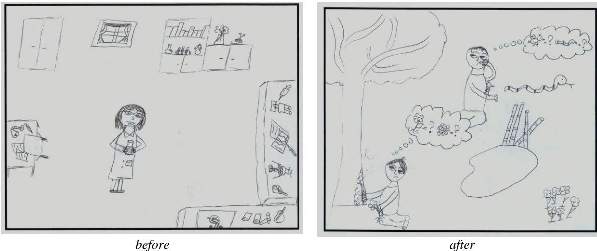
Figure 1: Drawing of student 3 before and after the application.

Figure 1 and Figure 2 shows two examples of pre and post drawings obtained by DAST during the study.