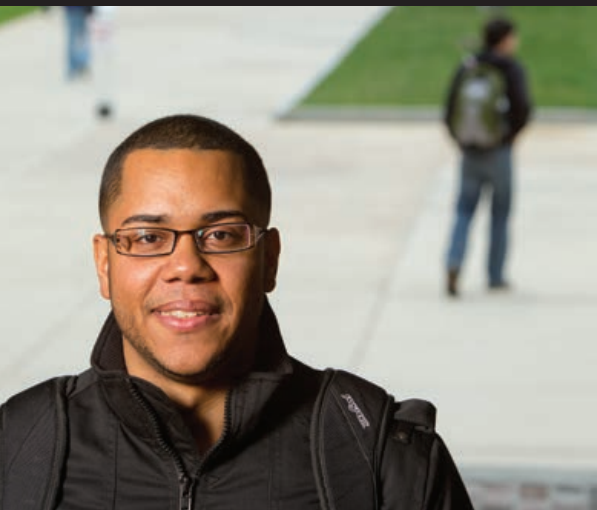
A new path in New England: Page 10