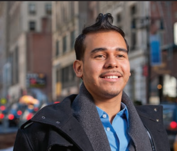
Big change in the Big Apple: Page 2