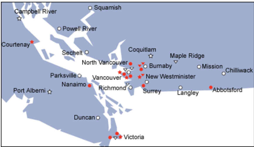
Source: Ministry of Advanced Education, Innovation and Technology, 2013