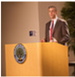
Mr. Arne Duncan, Secretary of the U.S. Department of Education