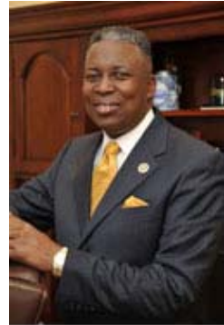
High Resolution Photo